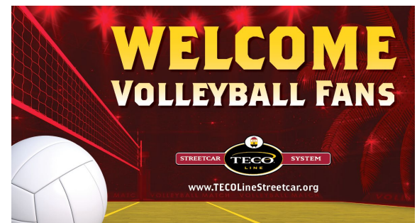
A “Welcome” message was installed on all streetcars for NCAA Volleyball Final Four